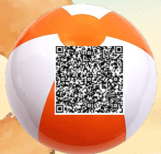
VA DONATION LINK