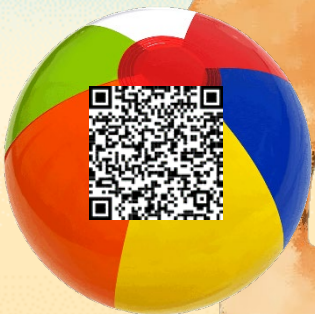
FOFH CHARLESTON DONATION LINK